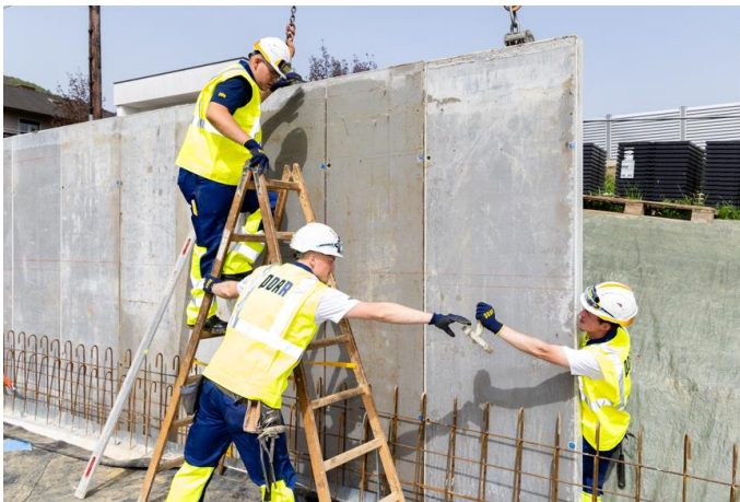
The PORR apprentices are building "their" three apartments in two months