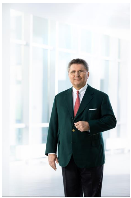
PORR CEO Karl-Heinz Strauss

This press release, including high-resolution images, is available to download from the PORR Newsroom.