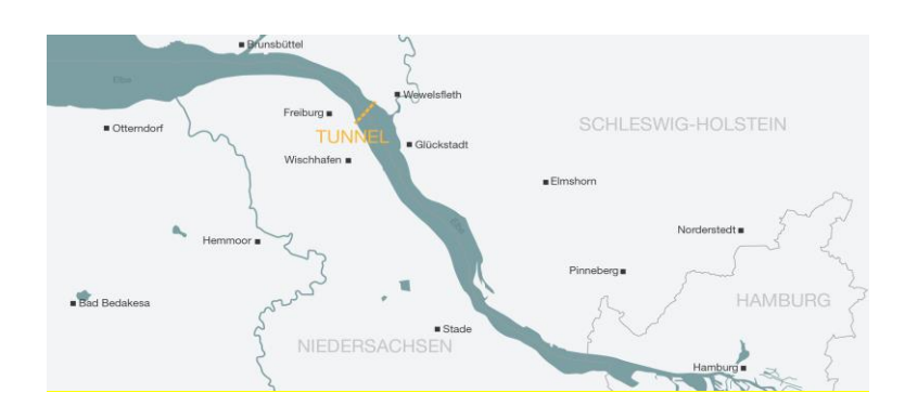
TenneT TSO GmbH, a leading European transmission system operator, has engaged PORR's tunnelling division for the challenging task of establishing the SuedLink connection below the Elbe, between Schleswig-Holstein and Lower Saxony.